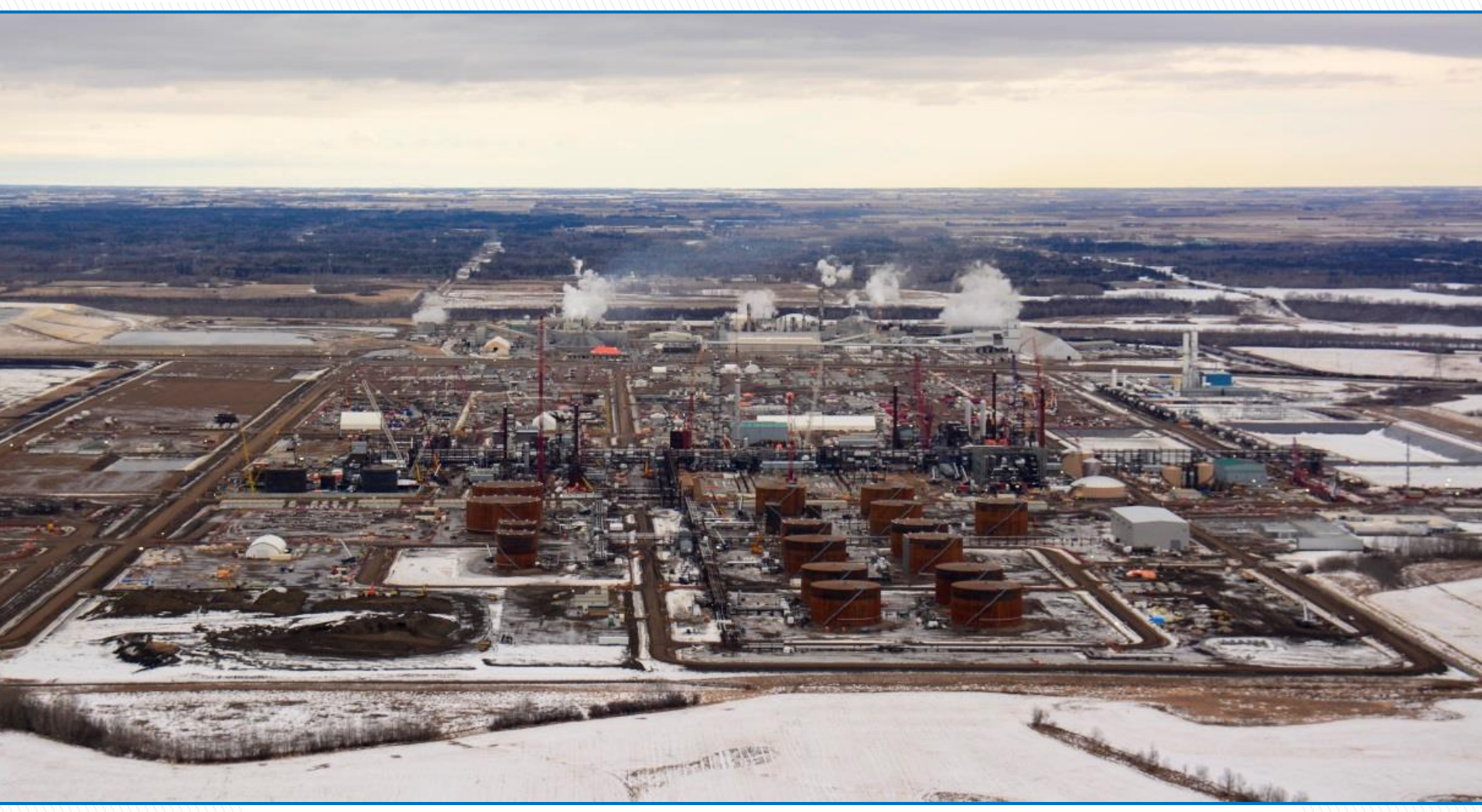
Looking East at Site