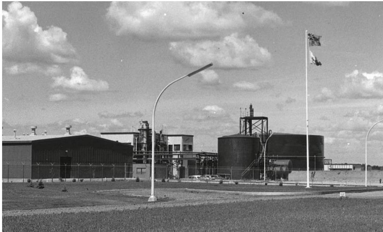
Site entrance (1962)