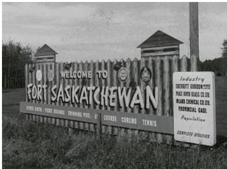
"Welcome to Fort Saskatchewan" (1959)