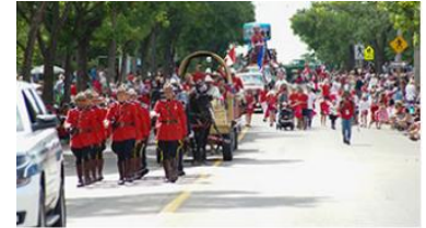
Canada Day Parade