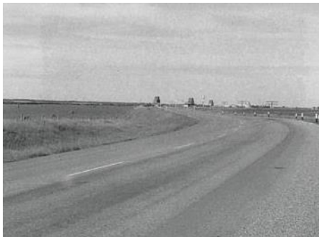
Highway 15 (1959)