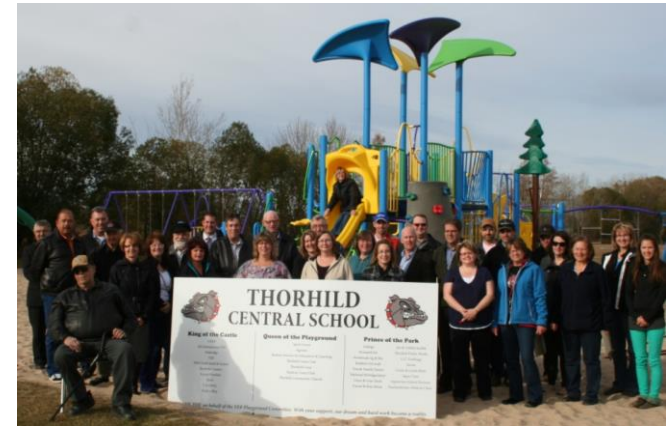
Youth Enrichment Foundation of Thorhild Community Playground at Thorhild Central School